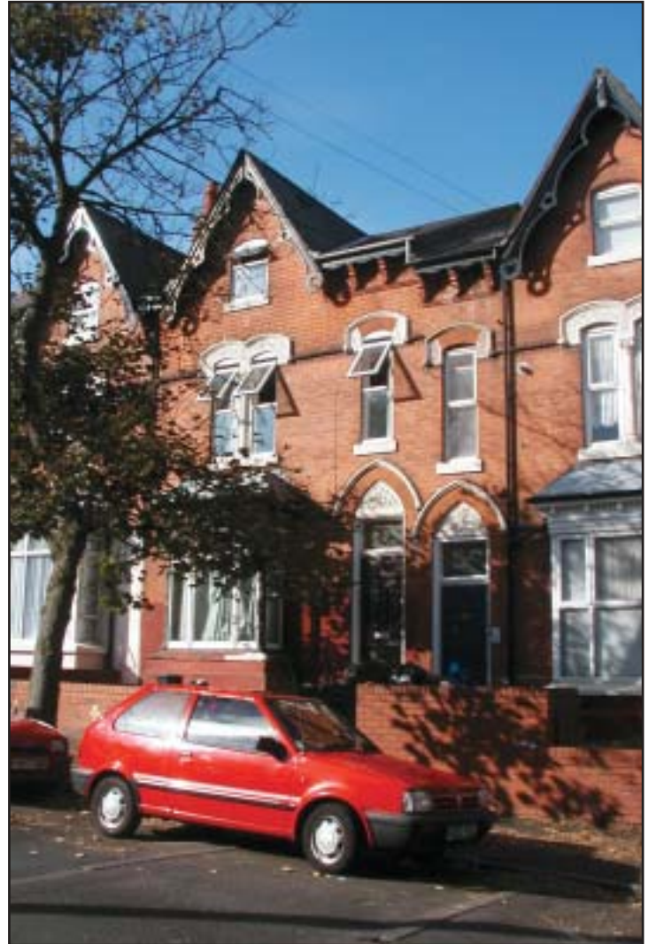
87 Edgbaston Road, Smethwick, West Midlands, B66 4LF