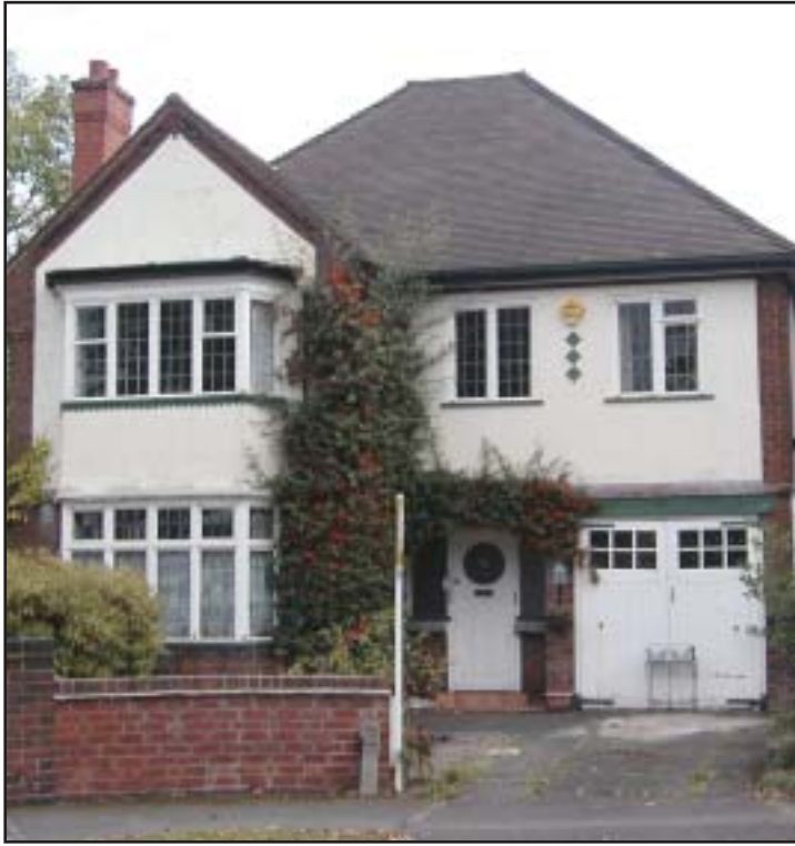
25 Manor Road North, Edgbaston, Birmingham, B16 9JS