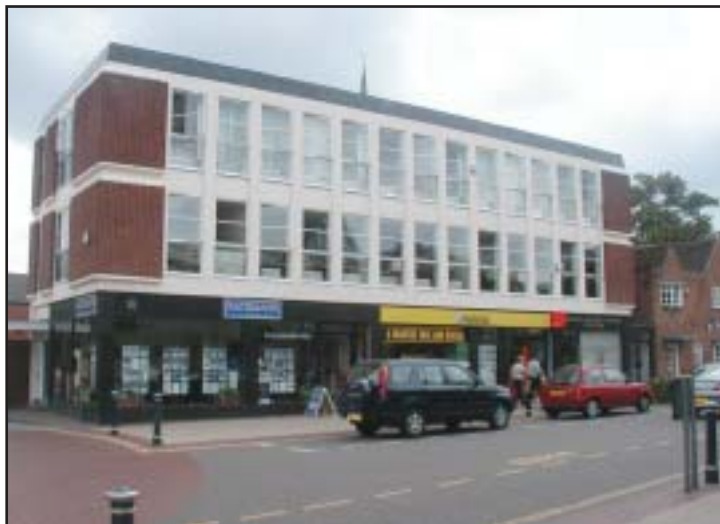
Skelcher House, Drury Lane, Solihull, West Midlands B91 3BD

Prestigious Office Investment located in Drury Lane, Solihull Town Centre, West Midlands. The property was built in the 1960's and comprises of a three storey building extending to approximately 816 sq m – 8805 sq ft (gross internal area) and is currently let on four separate leases to Westminster Bank, the Partners of Wallace Robinson and Morgan, Solicitors and Hayes Document Exchange. The current rental income is £108,250 per annum.