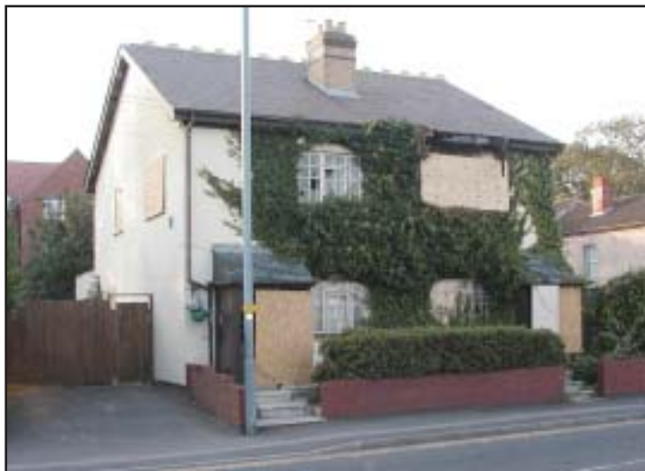
12/14 Baker Street, Sparkhill, Birmingham, B11 4SF